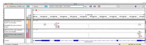
( B. rapa , B. oleracea mapped onto A. thaliana )